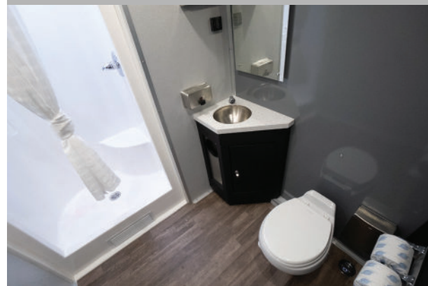
ADA Drop Suite