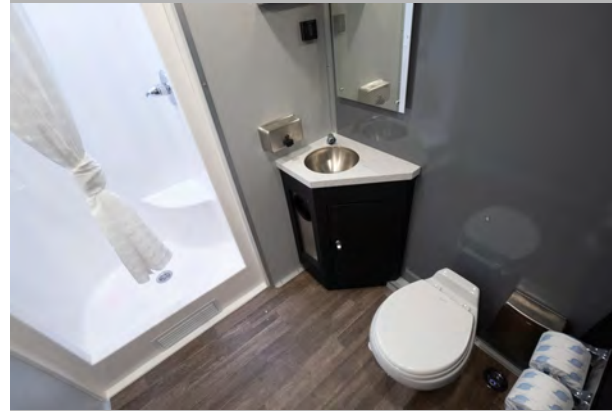
ADA Drop Suite